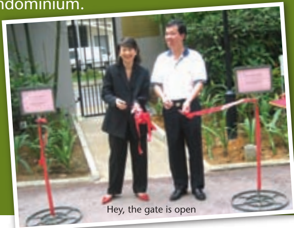
Hey, the gate is open

Collaboration between AMKH and our friendly neighbor, Seasons Park Condominium, saw the erection of a side gate at the rear compound of AMKH in October 2003 leading into the condominium.