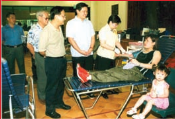
Mr Seng Han Tong, MP for Ang Mo Kio GRC and Advisor AMKH, talking to a donor

2003 is the 9 th year running where we collaborated with Yio Chu Kang Grassroots Organisations to hold this meaningful exercise held on the 2 nd November 2003. AMKH has been working closely with grassroots leaders to foster ties within the community to support this important voluntary national programme. It was also the 1 st time the event was held at the newly renovated Yio Chu Kang Community Centre.