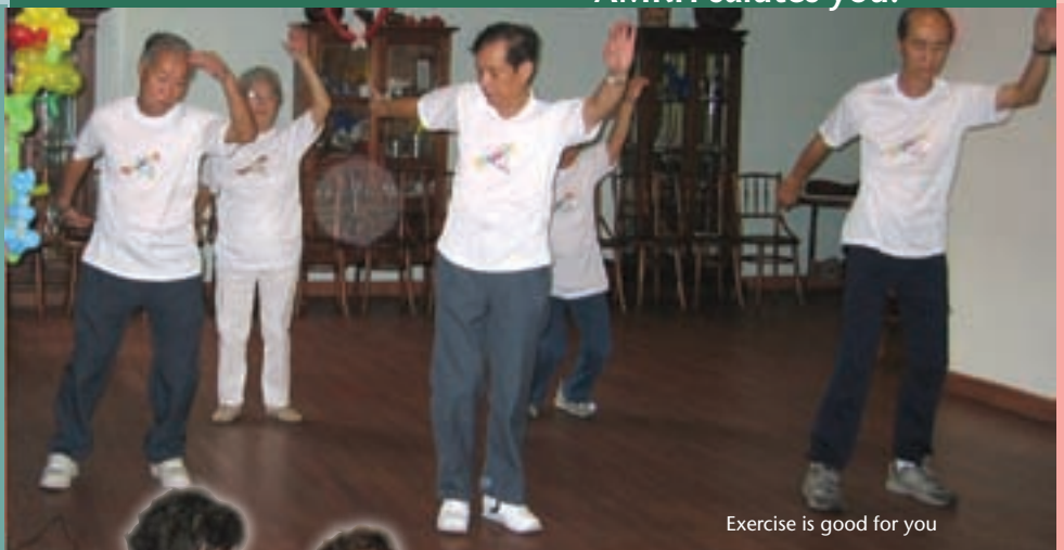
Exercise is good for you

Wow, what a week! To all senior citizens, AMKH salutes you!