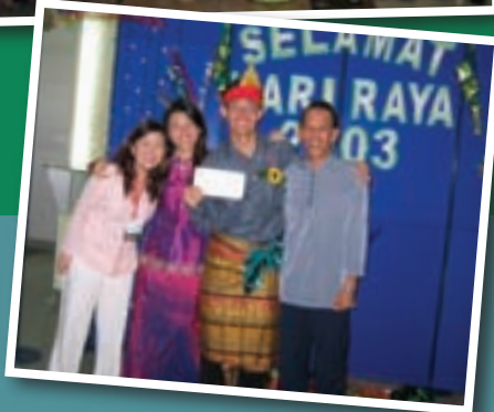
Winning team of the Best Malay Dress Game