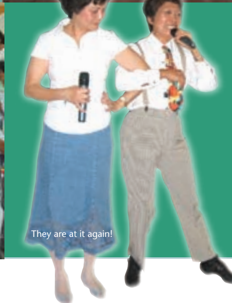
They are at it again!