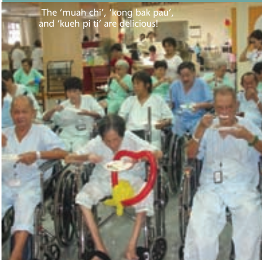
The 'muah chi', 'kong bak pau', and 'kueh pi ti' are delicious!