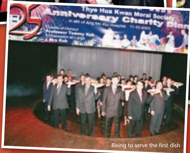
Rising to serve the first dish