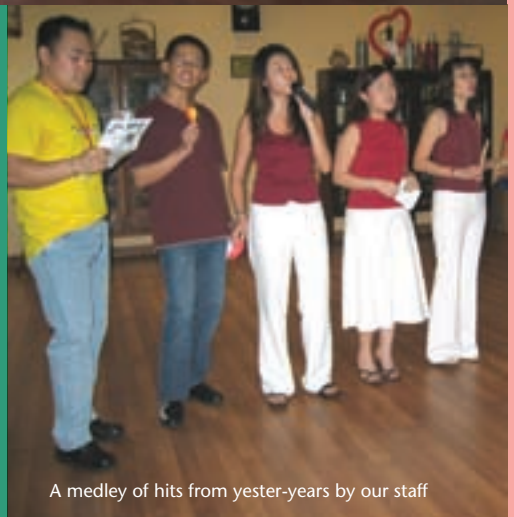
A medley of hits from yester-years by our staff