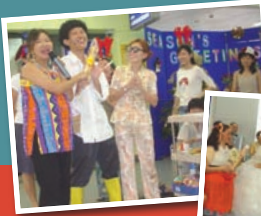
Phua Chu Kang came a visiting