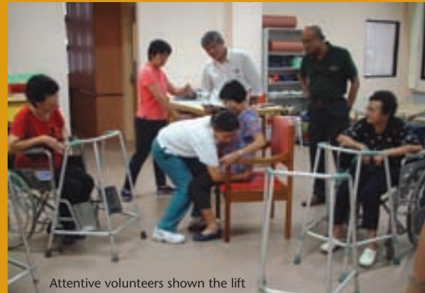
Attentive volunteers shown the lift