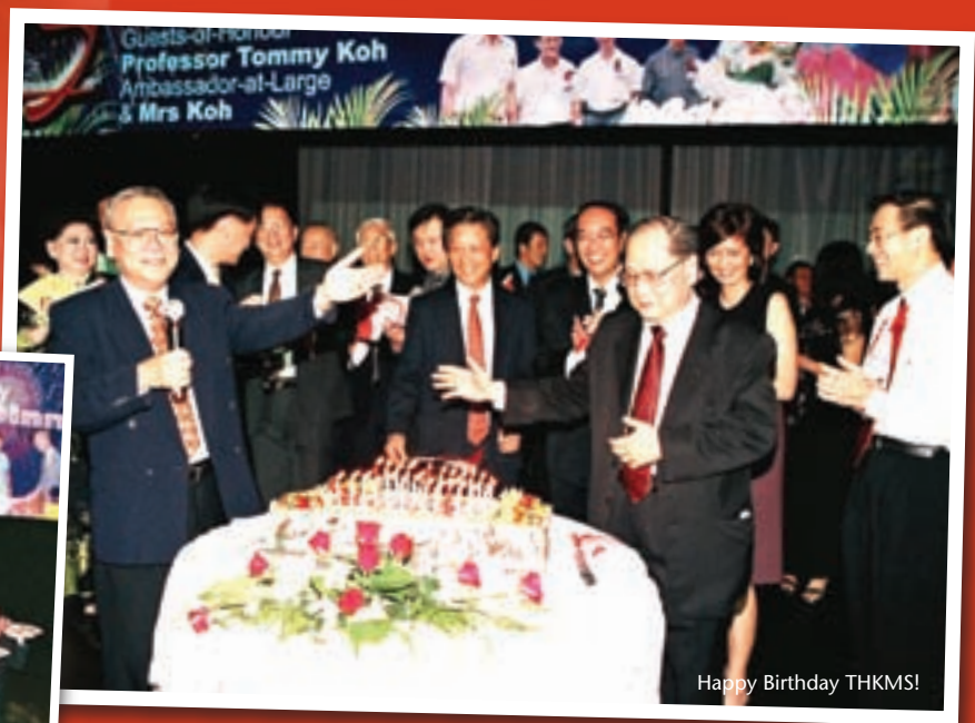
Happy Birthday THKMS!