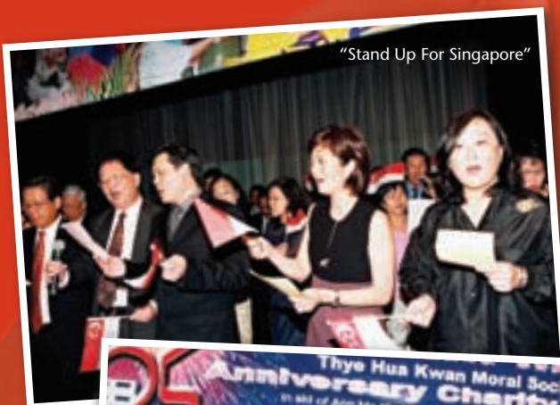
"Stand Up For Singapore"

The roaring finale saw a strong choir of over 1,000 guests singing their hearts out to the music, "Stand Up For Singapore" and "Count On Me Singapore", in one united voice. There was no better way to close the evening than a show of unity for a country we call our Home.