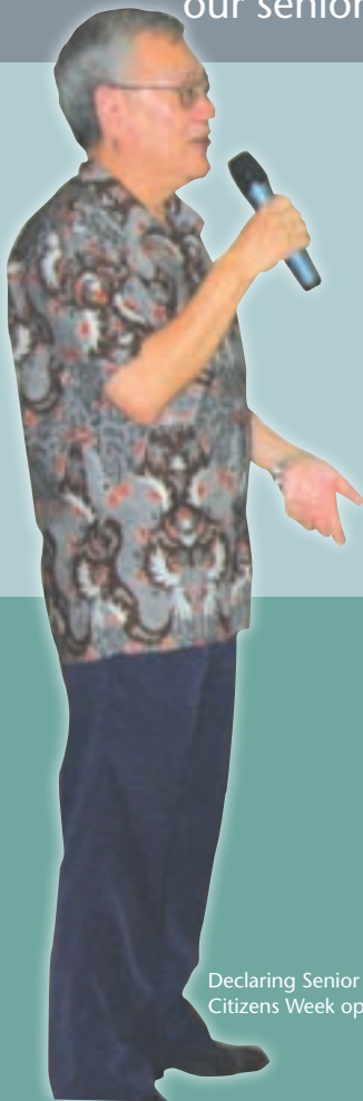
Declaring Senior Citizens Week open

Patients, visitors and even staff themselves were spoilt for choice with the program galore planned specially for our senior citizens