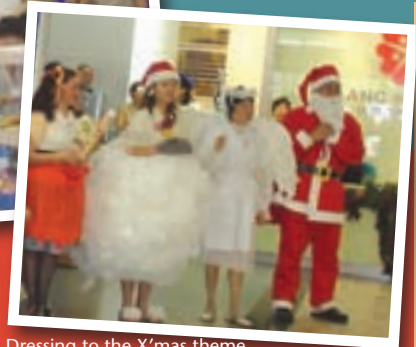
Dressing to the X’mas theme